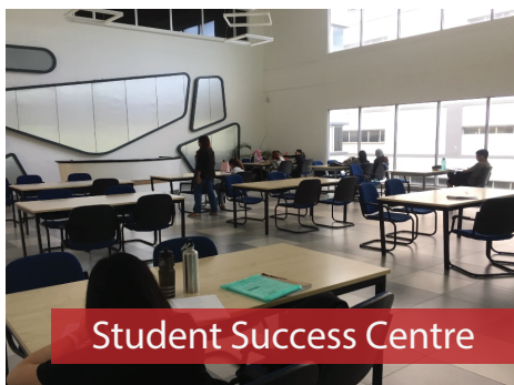
Student Success Centre