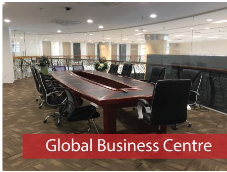
Global Business Centre